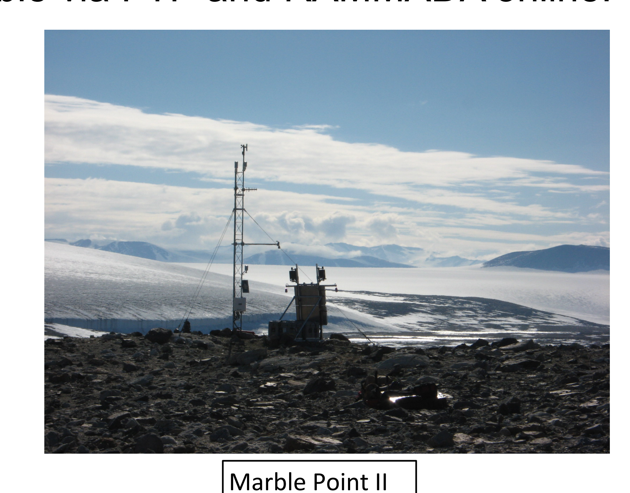
McMurdo Area: This region is seeing a number of improvements. Recent installation and expansion of a Freewave network routes realtime data through McMurdo station. Ozone monitoring stations are also connected to the Freewave network, providing observations necessary for improving understanding of Tropospheric Ozone Interactions. Alexander Tall Tower is a 100 foot tower providing measurements at various levels throughout the boundary layer and lower Troposphere