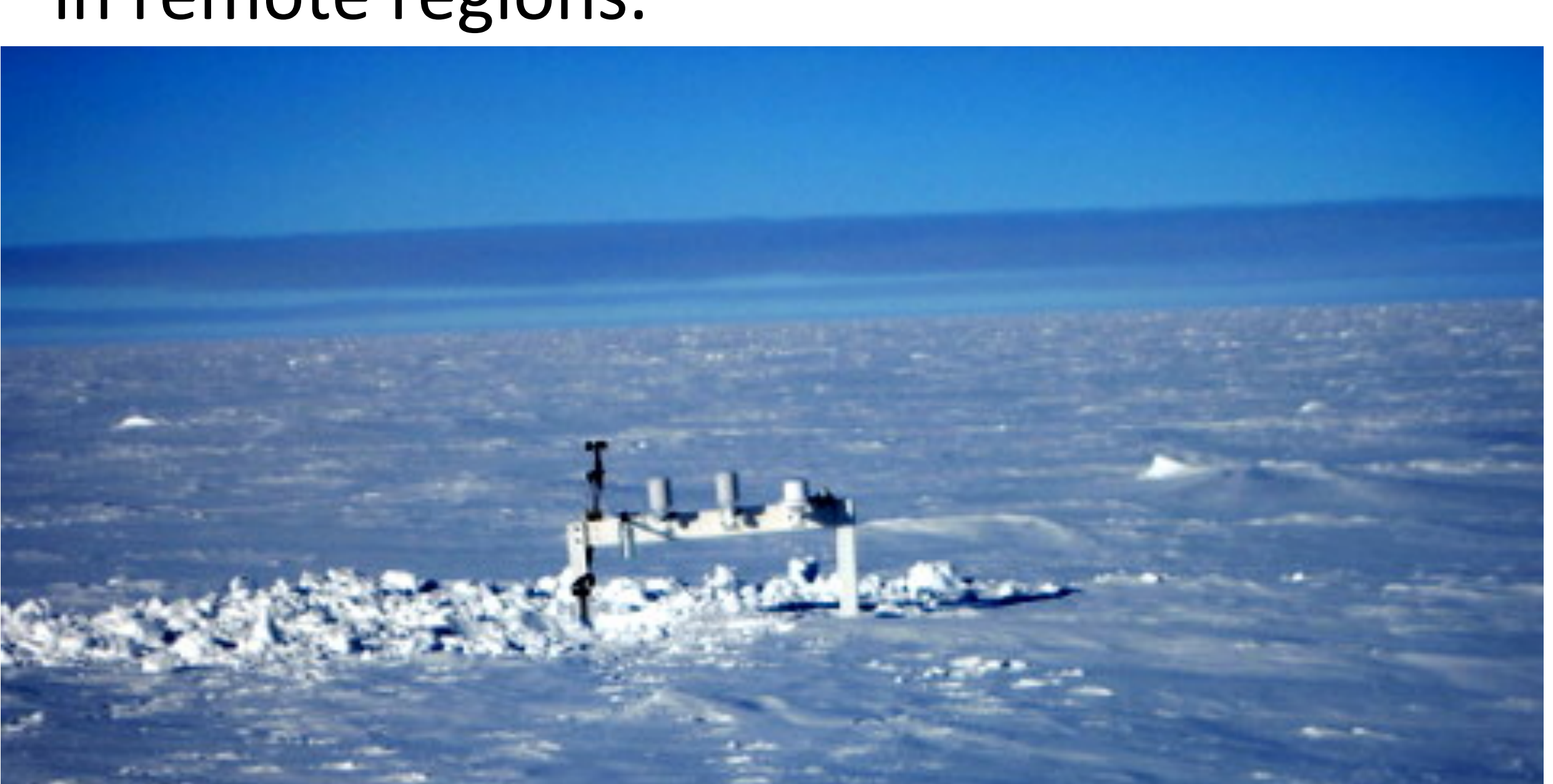
South Pole Test Station

East Antarctica: Throughout the polar plateau region, we collaborate with several other countries, providing them with weather systems that they have installed. ✓ Our interests in the region include improving understanding of biases in measurements caused by radiation shields as well as understanding of climate patterns in remote regions.